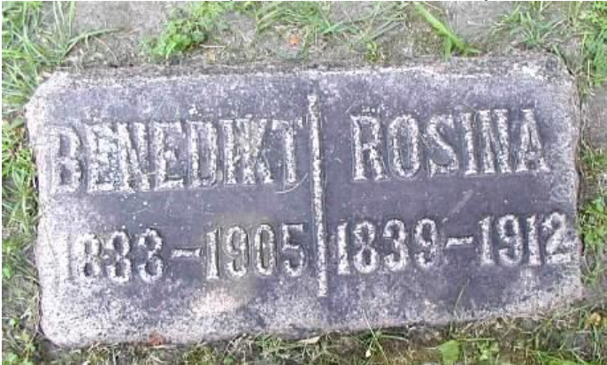
Woodside Cemetery, Shorewood, Hennepin County