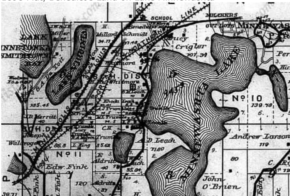
Benedict's Civil War Diary