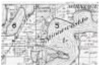
Maps, Plats, Deeds.