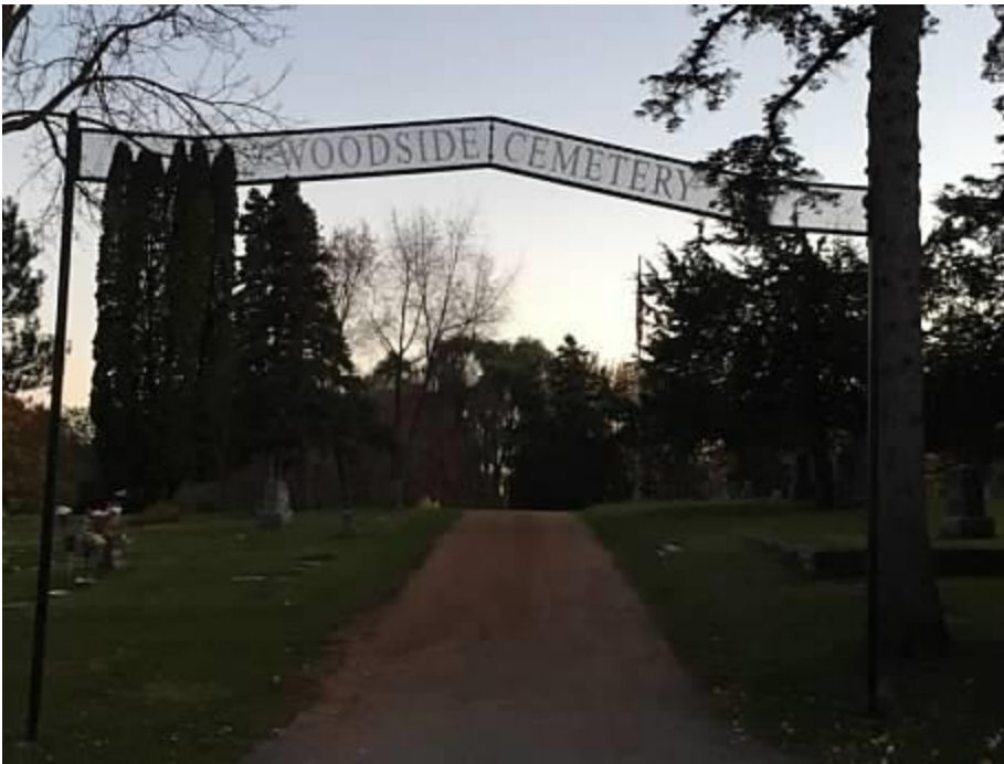
Minnesota 2nd Vol. Infantry