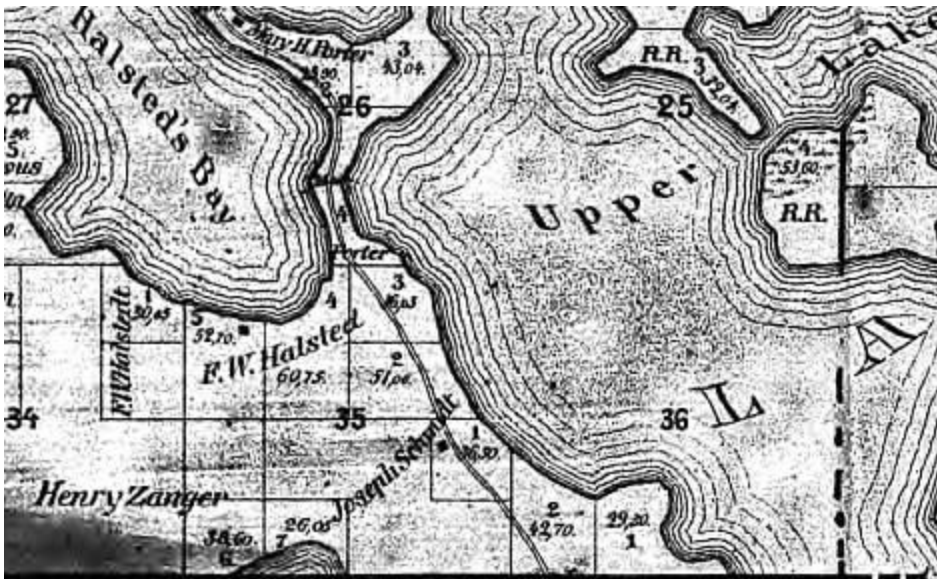
Early Settlers include Schmid, Schmiegl, Pfeiffer