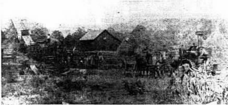
Early Threshing Scene

highlights. Houses were lighted with candles. Kerosene and oil lamps were not in use until quite a few years after the beginning of the petroleum industry in 1859. Up to 1890 there was no market for gasoline, which then sold for 2c a gallon. Small threshing machines appeared in the late '60's and were powered with a horse