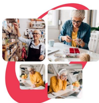
Image screenshot from VIA build.