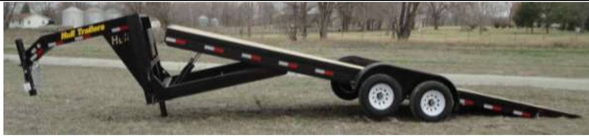
(Model shown above: 24' GT tilt, 9,990lb GVWR, full Thinline LED lights. Sells for $5,845 as shown)

Everything our powerful E/T bumper pull trailer is with the advantage of a gooseneck and more commercial grade hydraulics including TWIN cylinders under the bed to lift and lower deck and all hydraulics and 750 amp hour battery are contained in a locking control box in the tongue, just like our dump box trailers. Base models still have only tandem 3,500lb axles but you can upgrade to 9,990, 14,000 or even 21,000lb triple axle models from the options below.