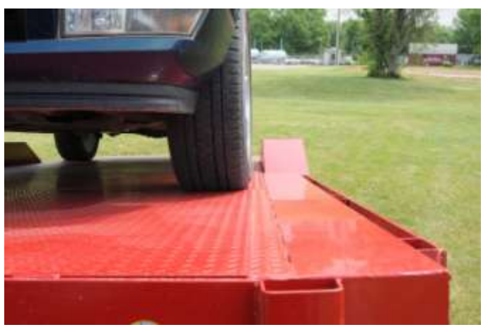
separately). Fender width floor on 20' trailer? $800

What does it cost? Fender width floors are $40 per running foot of trailer and do not include the drive over fenders.. (we have some customers who want the fender width floor and removable fenders... so you figure the floor and the fenders you want