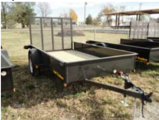
We originated the SS style solid steel side utility in 2001 and everyone builds a copy of it now. We take that as flattery.