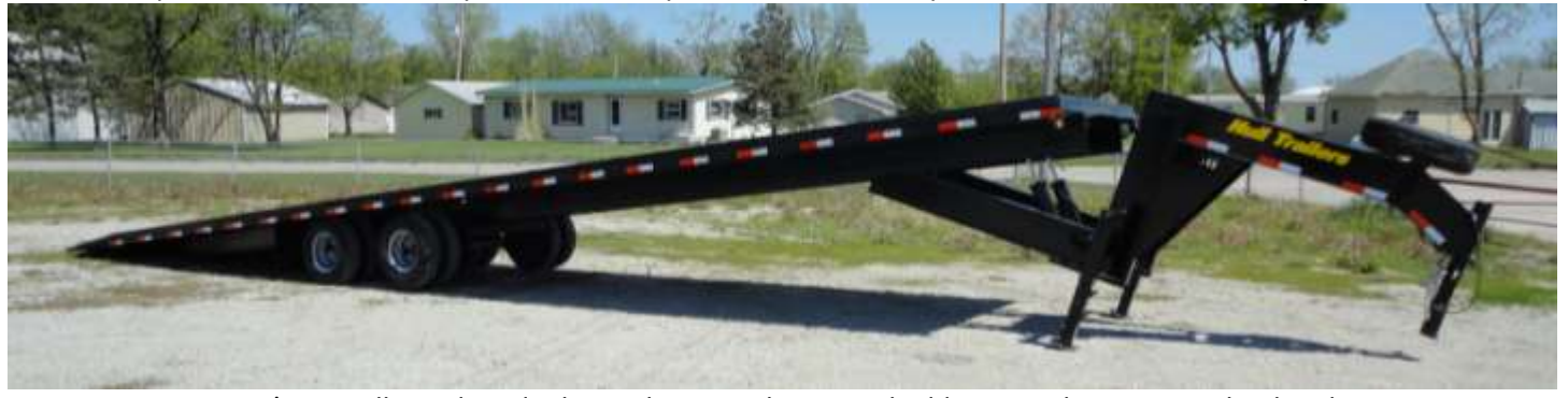
44' 20,000lb tandem dual unit shown with optional add on matching spare wheel and tire.

All of the rugged design of our Hi Deck Trailers, plus you just push a button and tilt the deck! Completely self contained 20,000 plus pound lift capacity hydraulic tilting bed with included deep cycle battery that charges through your tow vehicles trailer plug. Full 102" wide floor in 24-44 foot lengths. Full LED lighting, rub rails with spindle and pocket tie downs, 90 day nose to tail, 5 year axle and full 10 year frame and floor warranty all standard.