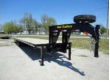
Available Models 30' deck length 14,000lb GVWR $9,395 34' deck length 14,000lb GVWR $9,795 39' deck length 14,000lb GVWR $10,095 44' deck length 14,000lb GVWR $10,495

Upgrade chassis to triple 7,000lb suspension system /frame upgrade with dual landing gear, 21,000lb GVWR $995 Upgrade entire chassis to 20,000lb tandem dual suspension and frame with dual landing gear $1,595 Upgrade entire chassis to full 24,000lb tandem dual suspension system with dual landing gear and more $3,695 Many other options available, but the standard trailer comes pretty well completely equipped!