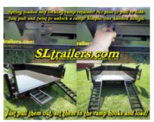
Complete, commercial use ready and tough as nails.