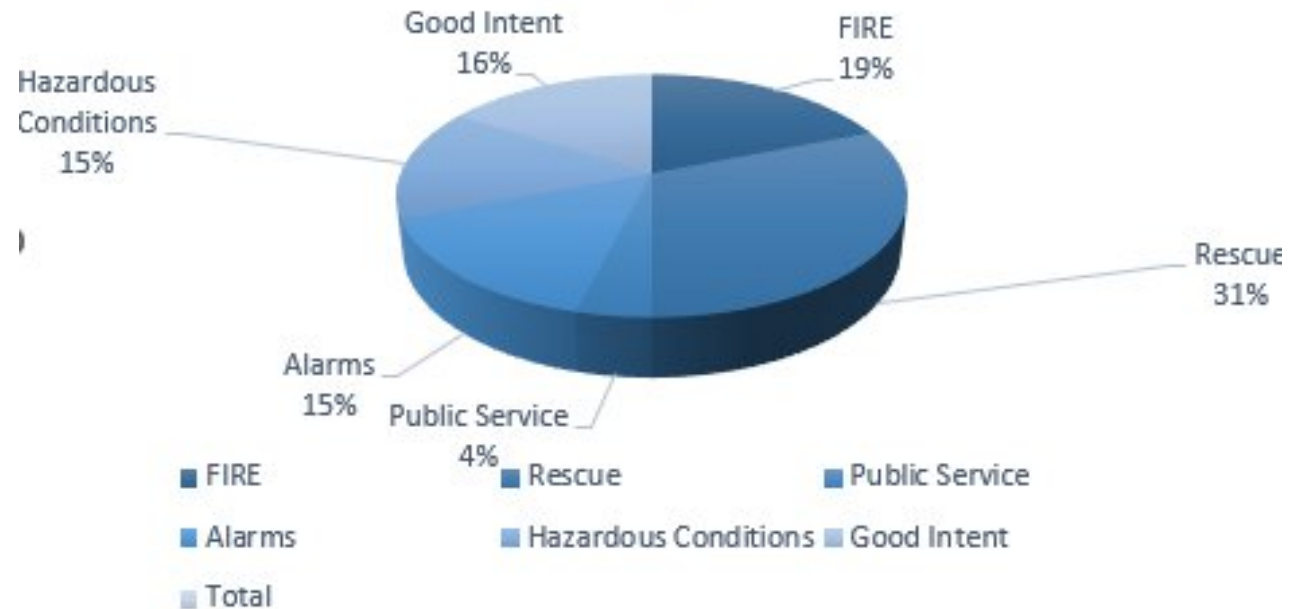
West Lakes Fire Dept. March emergency Call Volume