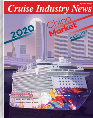
China Market Report