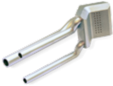
Gas burner with integrated cooling channels in LaserForm Ni718 (A)