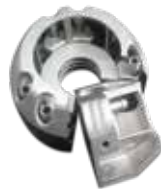
Blow mold with conforming holes in LaserForm Maraging Steel (B)