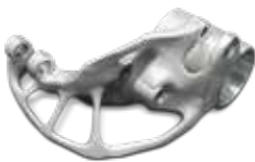
Topologically optimized rocker bracket in Certified Scalmalloy