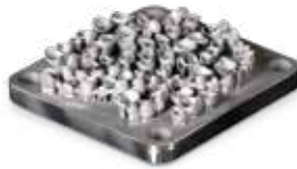
Partials, copings and bridges production in LaserForm CoCr (C)