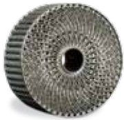
Heat exchanger with complex cooling channels in LaserForm AlSi10Mg (A)

3D Systems' broad range of ready-to-run LaserForm materials is formulated and fine-tuned specifically for 3D Systems DMP printers to deliver high part quality and consistent part properties. 3D Systems provides a print parameter database that has been extensively developed, tested and optimized with materials in 3D Systems' part production facilities. These facilities hold the unique expertise of printing 500,000 challenging metal production parts in various materials year over year. 3D Systems also employs a thorough Supplier Quality Management System to deliver consistent, monitored material quality for reliable results.