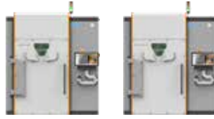
DMP Flex 350 and DMP Flex 350 Dual