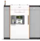
DMP Factory 500