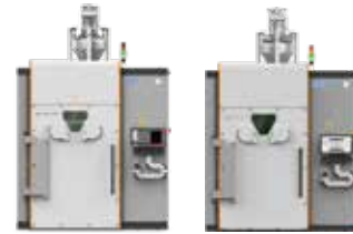
DMP Factory 350 and DMP Factory 350 Dual