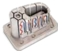
Injection molding tool with conformal cooling in Certified M789