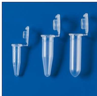
MICRO CENTRIFUGE TUBE