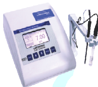
PH METER TABLE TOP