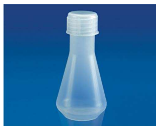
CONICAL FLASK WITH CAP