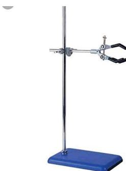
RETORT / BURETTE STAND