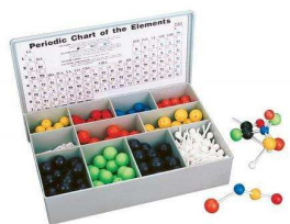
ATOMIC MODEL SET