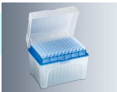
PIPETTE TIP BOX