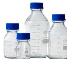
REAGENT BOTTLE SCREW CAP