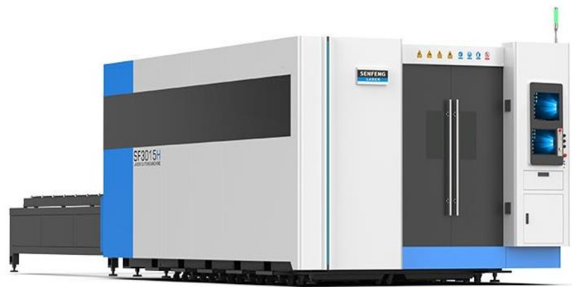
6kW Fully Enclosed Metal Tube & Plate Fiber Laser Cutting Machine