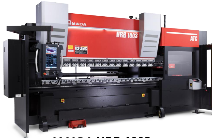
AMADA HRB 1003 High Precision Press Brake