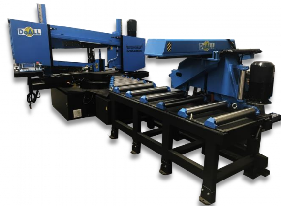
DoALL 600 CNC Automated Band Saw

CWF Accredited Facility October 10, 2022 CERT #230301F