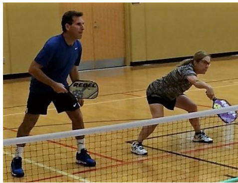
Shatz attack (Sol & Sue)