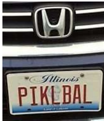
some 5.0's plate