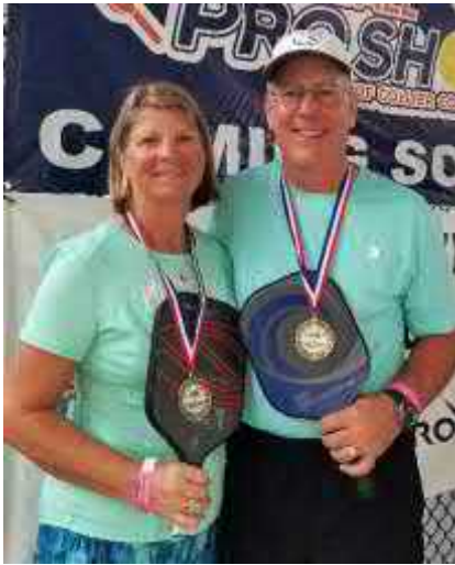
3.5 55+ Gold at Southern Tropics in Naples, FL ... 16 teams

That's "Melody & Greg's Medals" Show. While avoiding snow, the Woodsums have covered the map playing.