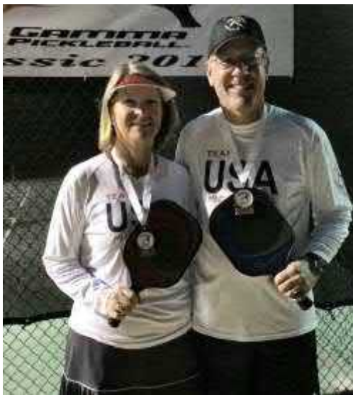
Bronze 3.5 in W Riverbend Gamma Tourney in LaBelle, FL ... 6 teams