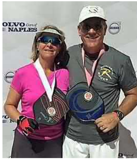
3.5 Silver at West Cupid Shootout in Bonita Springs, FL ... 12 teams