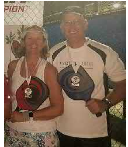
3.5 50+ Bronze at West Silver Palms Tourney in Okeechobee, FL