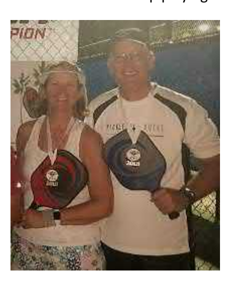
3.5 50+ Bronze at West Silver Palms Tourney in Okeechobee, FL