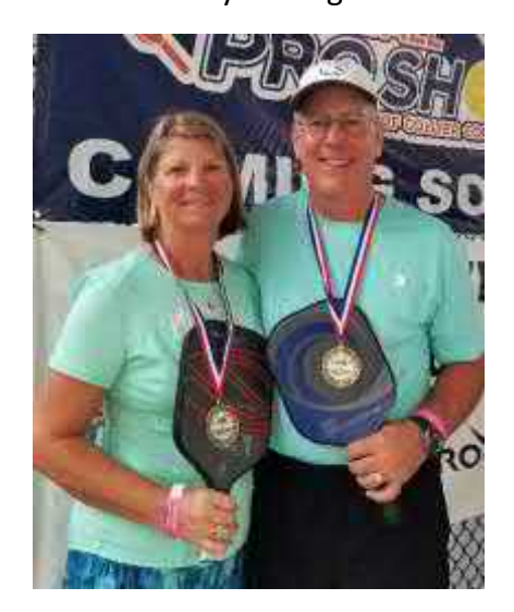
3.5 55+ Gold at Southern Tropics in Naples, FL ... 16 teams

That's "Melody & Greg's Medals" Show. While avoiding snow, the Woodsums have covered the map playing.