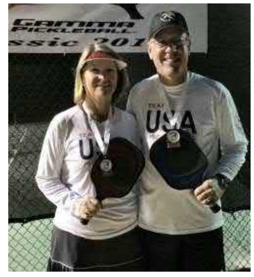
Bronze 3.5 in W Riverbend Gamma Tourney in LaBelle, FL ... 6 teams