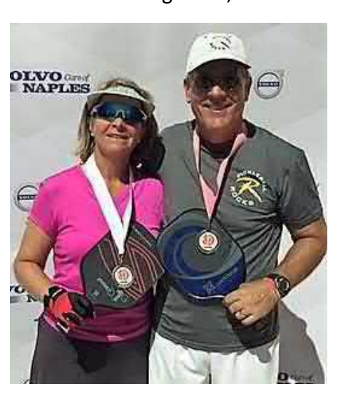
3.5 Silver at West Cupid Shootout in Bonita Springs, FL ... 12 teams