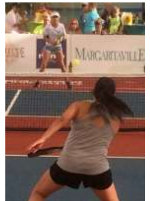
11-yr old wins 5.0 45 & under ladies match