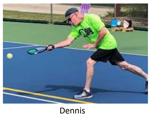
BALL $$$ WELCOMED

Thanks for your donations. If you'd like to help buy even more balls, the Crown Royal bag attached to my chair at Sycamore awaits. I have another Crown Royal bag in my gym bag, when I play indoors.