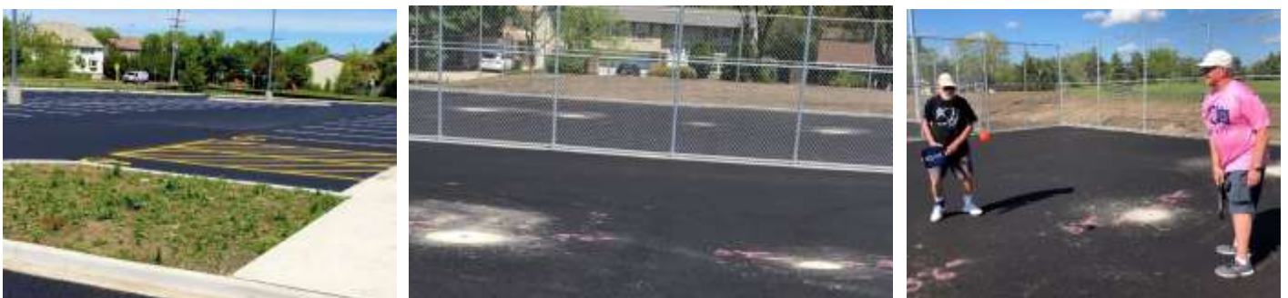
Parking lot is done

The Park District told meet me some great news. The courts may be ready for play by mid-June, weather permitting, and they'll feature kitchens of a complimentary color. After these pics a base coat went down.