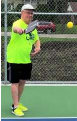
Bear had 1 st serve on courts