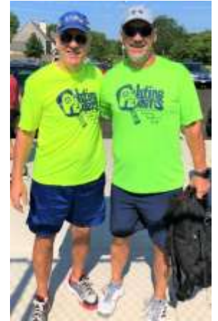
Fluorescent & shady Gregs