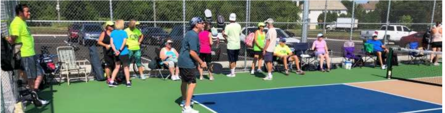
Tuesday’s competitive crowd begins to grow