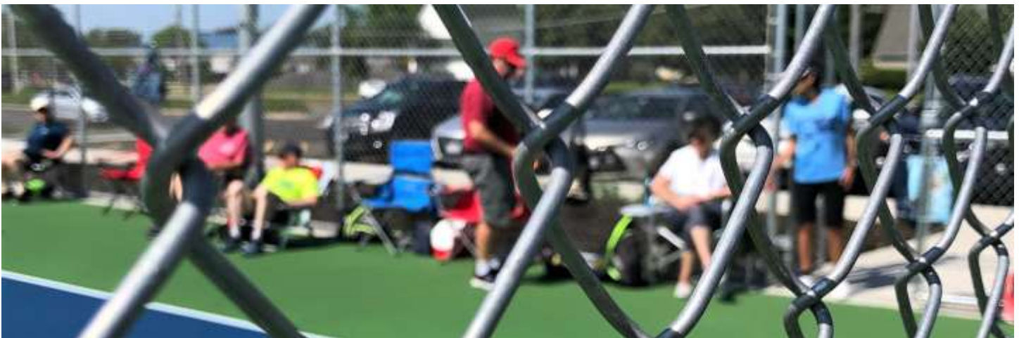
So does the recreation crowd

The courts are beautiful. Our “Grand Opening” Picklers ate 65 donuts & took 44 felt bags and 😞 7 of 24 balls.