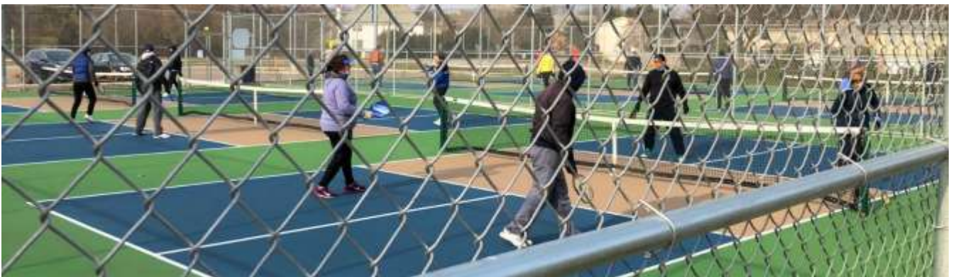
30 Picklers played in 30 degrees on December 18 th

Our sixth year wasn't quite as much fun. COVID-19 came calling. Many members haven't played pickleball in 11 months. We lost our indoor venues, save a few poorly attended days in the fall. Outdoor courts were locked until June 4th. Desperate for play, Picklers flocked to Hamilton from early June to well into December, despite temps as low as 28 degrees. We had to adapt to touching only our own ball and not entering the kitchen for post-game celebrations. We were good at setting up our chairs 6' apart but struggled with not bunching up at the paddle racks. I'm sure we'll be better, whenever Hamilton opens in spring or summer.