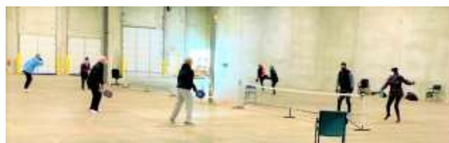
bunch of happy Picklers