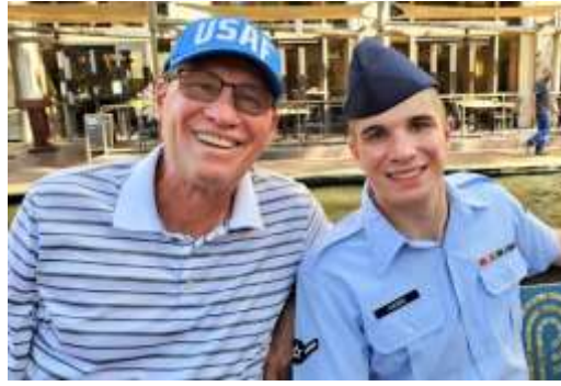
Grandson Cam's graduation from AF boot camp