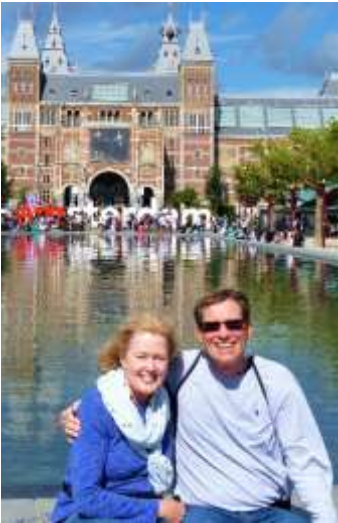
Amsterdam part of honeymoon