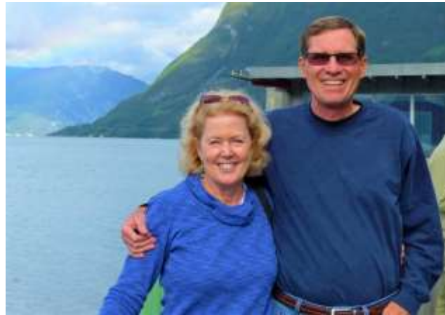
Norway part of honeymoon