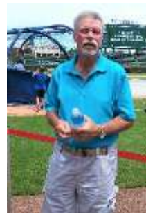
Knocked 2 out