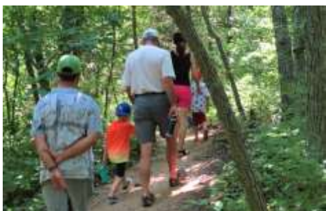
Mountain trails in KS with grandsons