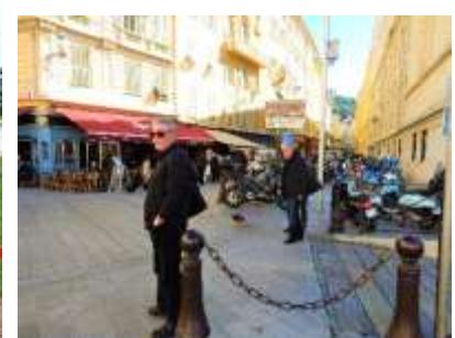
“Playine nice in Nice”pHe’s