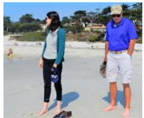
Looking for golf balls on Pebble Beach