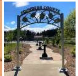
Bricks far side of 1 st kiosk