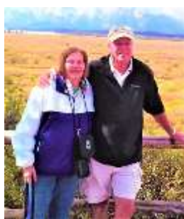
In Jackson Hole