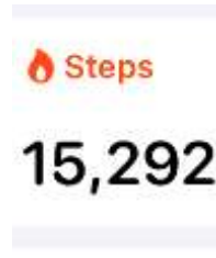
Bear Shatwell – 15,292