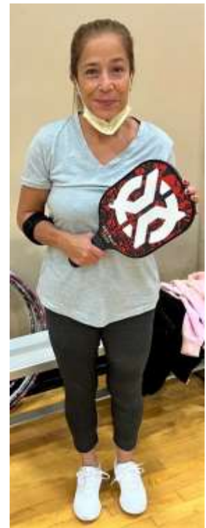
(sorry – lost name)