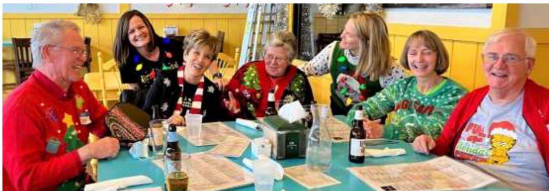
Lunch at nearby Kelsey Road House was a great ending to a fun morning