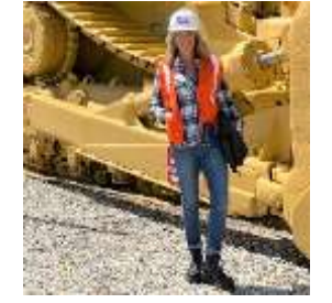
Visiting Peoria customer