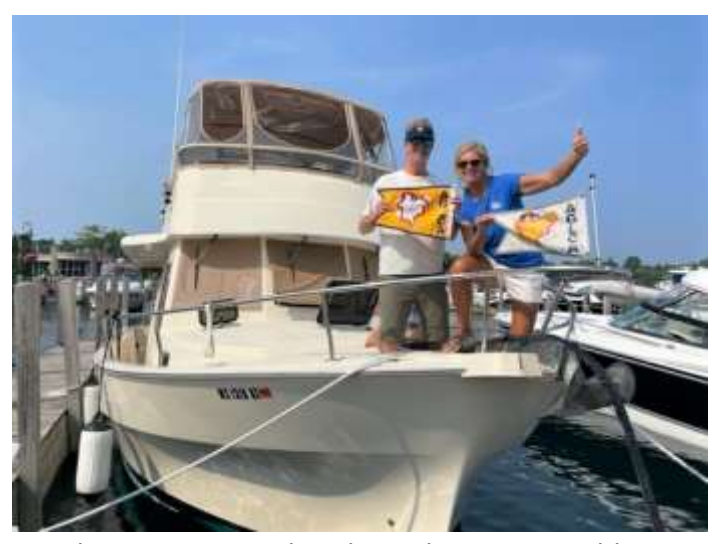
Beautiful day to visit Miss Liberty