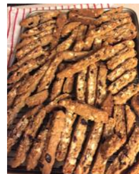
Chocolate and Cherry