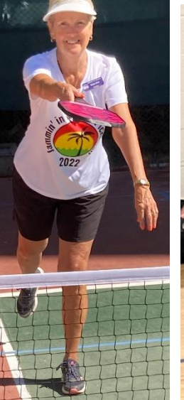
Stana (by Clay)