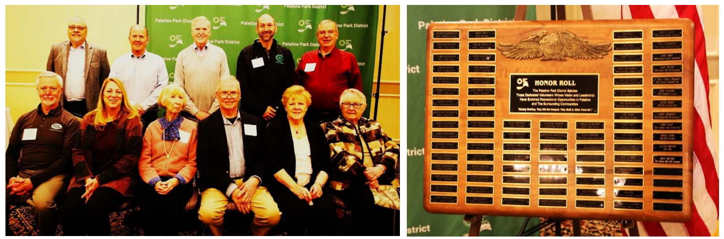
Members of the Palatine Park Distgrice 's Honor Roll. Bear front center ... and on the Wall of Fame plaque