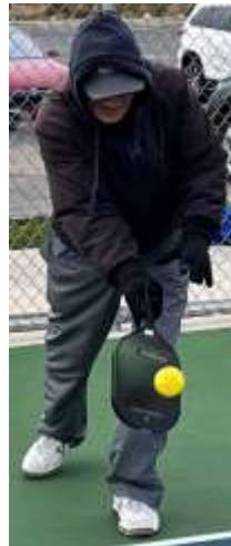
The Grim Stever