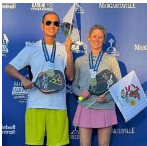
USA Nationals, Indian Wells, CA 4.5 35+ - Gold