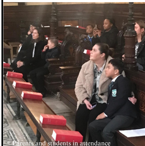
Parents and students in attendance