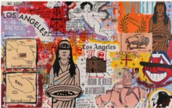
Reclaiming El Camino: Native Resistance in the Missions and Beyond