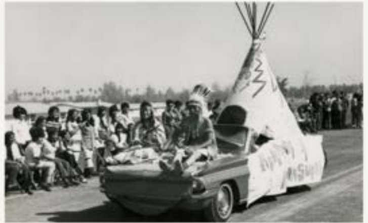
Sherman Indian School: 100+ Years of Education and Resilience