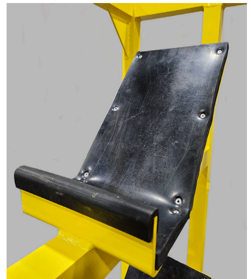
Padded blade holding brackets.