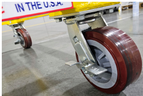
360-degree swivel casters.