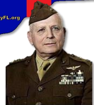
General Roy S. Geiger Detachment #1047

Marine Corps League Is looking for: THE FEW – THE PROUD Marines FMF Navy Corpsmen FMF Navy Chaplains