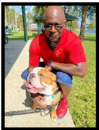
An Ex-Marine Does not Exist!

Active, Reserve, Retired and Veteran U.S. Marines, FMF Navy Corpsman, FMF Navy Chaplains.