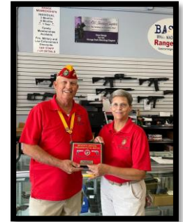
Annual Pistol Match