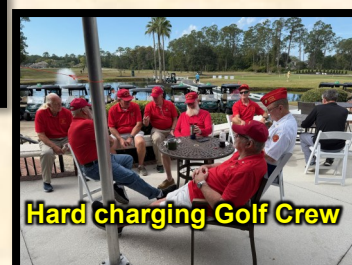
Hard charging Golf Crew