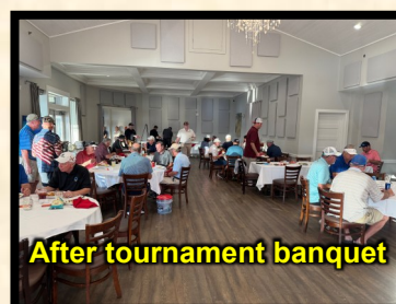
After tournament banquet