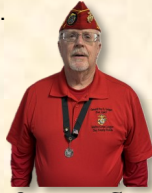
Semper Fi Pup Rusty Park (904) 401—3727