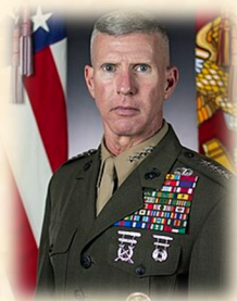
General Eric M. Smith Commandant Marine Corps