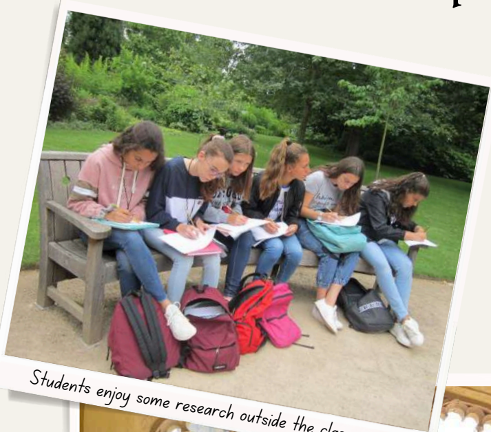
Students enjoy some research outside the classroom