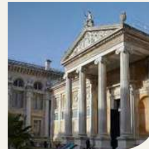
Clockwise from top left: The public library The Radcliffe Camera Gloucester Green Market The Covered Market The bus station The King's Arms Christchurch Meadow The Ashmolean Museum