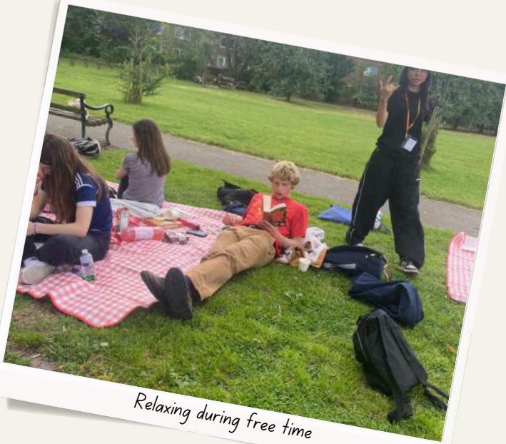
Relaxing during free time