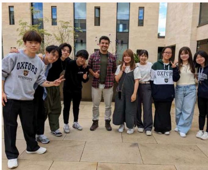
College tours and conversations with Oxford University students