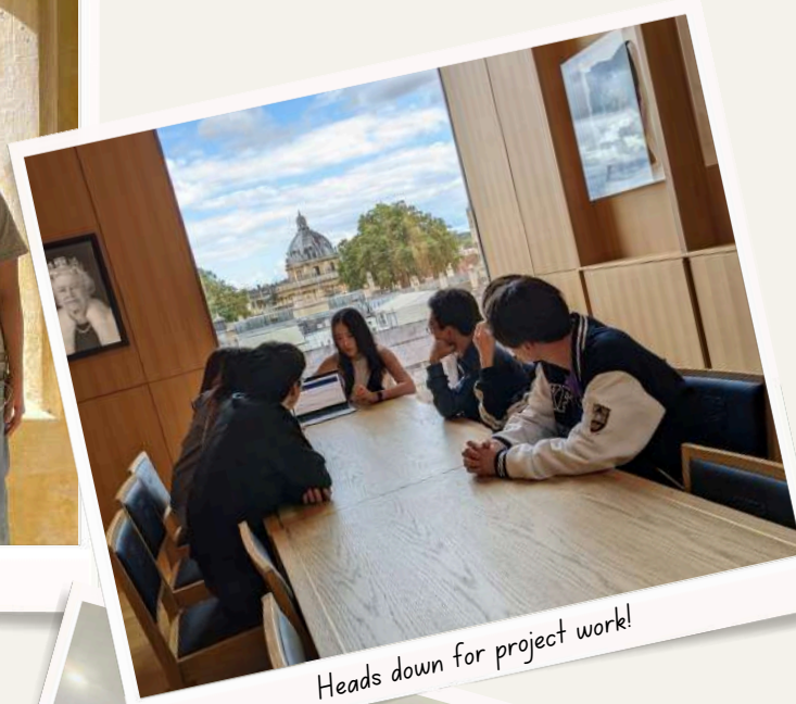
Heads down for project work!