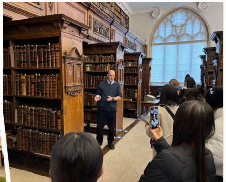
The fellow's library holds the college's 11,500 early printed books.