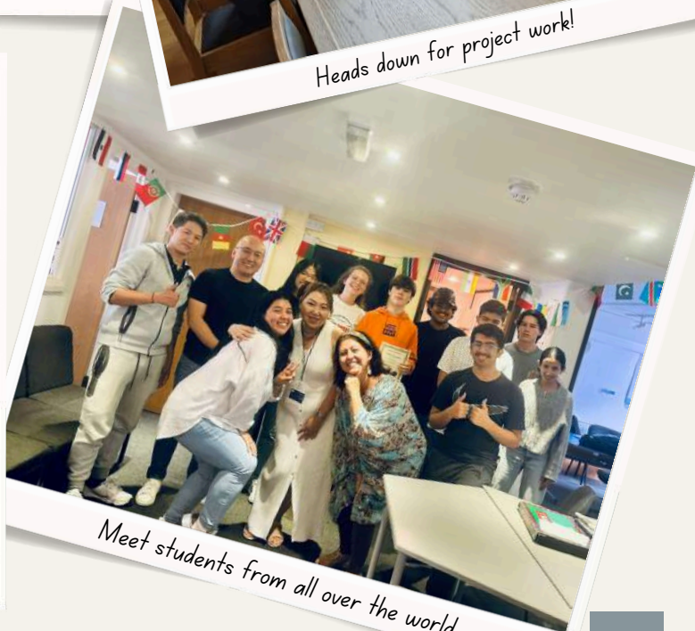
Meet students from all over the world