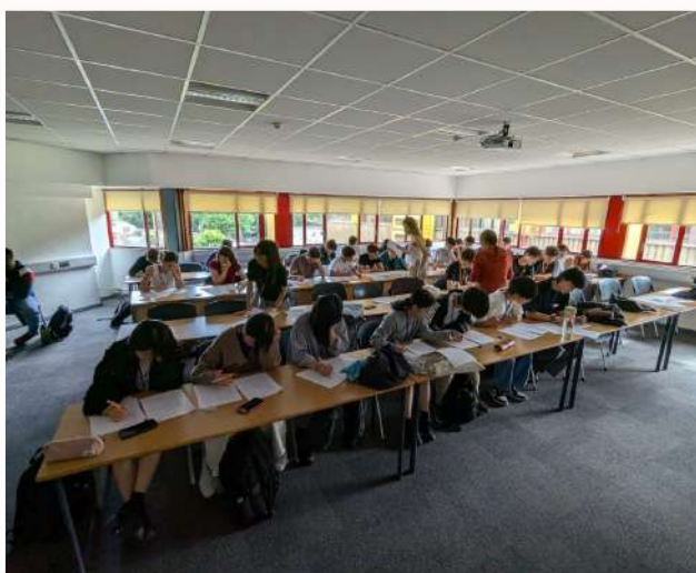
First day in class at City of Oxford College