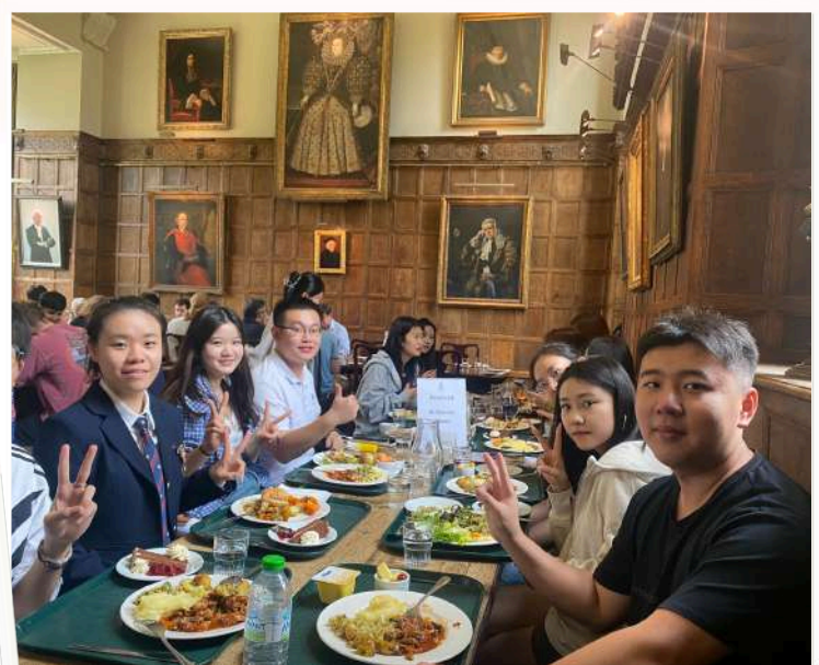
Students enjoy a wide range of tasty meals.

Join us for a feast every evening in the beautiful Jesus College dining hall! After dinner, students can relax in the Jesus College common room