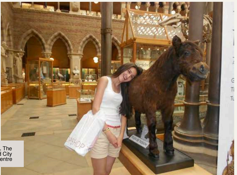
From top to bottom: Windsor Castle, Brighton, The Cotswolds, The Natural History Museum. Opposite page: Port Meadow, Oxford City Centre