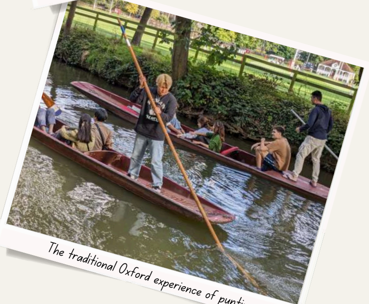
The traditional Oxford experience of punting