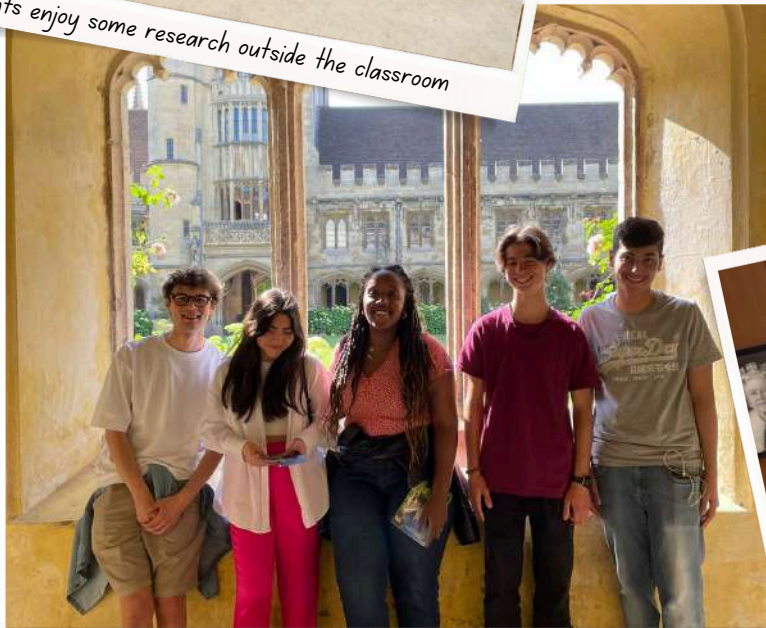
Did you know Harry Potter was filmed here?