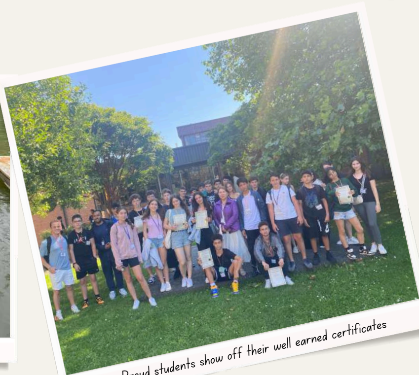
Proud students show off their well earned certificates