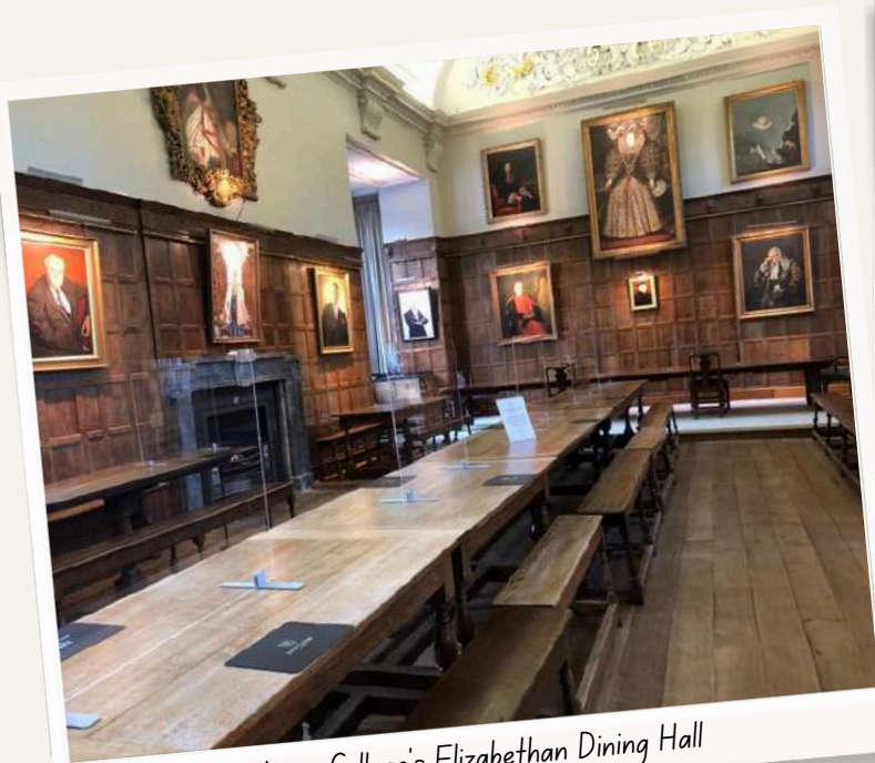
Jesus College's Elizabethan Dining Hall