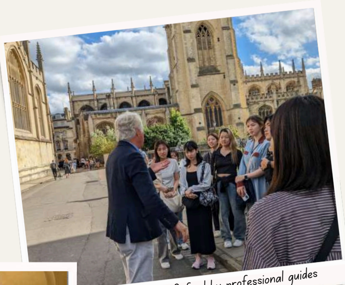
A walking tour of Oxford by professional guides