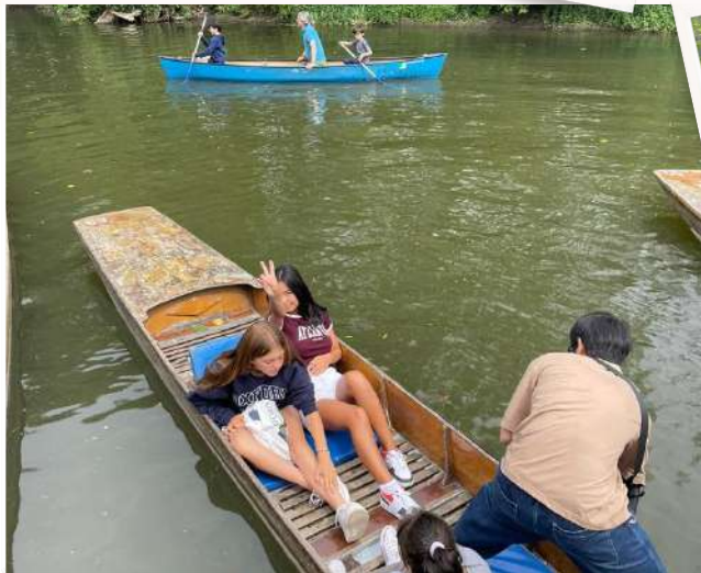
CIE students take to the River Thames!