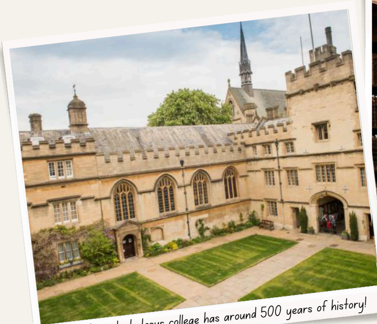
The first quod at Jesus college has around 500 years of history!

Jesus College, founded in 1571 by Queen Elizabeth I, is one of the constituent colleges of the University of Oxford. With a mix of historic and modern buildings, Jesus College provides a picturesque and inspiring setting for study and research.