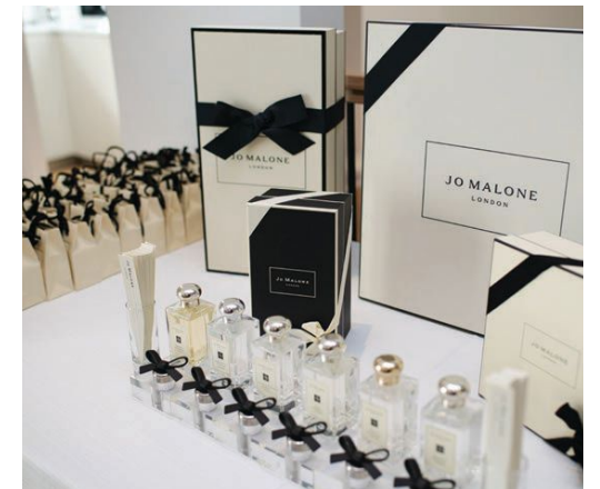
Jo Malone Scent Bar.