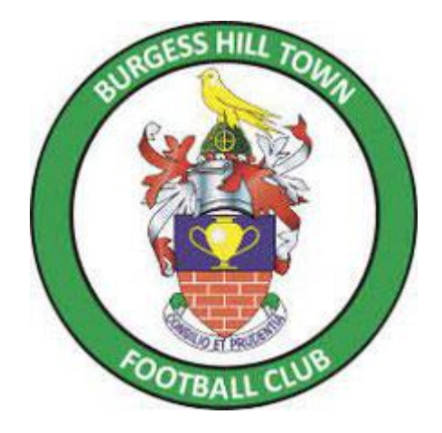
Burgess Hill Town 1 Hythe Town 4 Pitching In Isthmian League South-East Saturday 8<sup>th</sup> April 2023

In an explosive first half, the Cannons put the game out of Burgess Hill Town's reach as they deservedly went into the half time break with a three-goal lead and despite a second period onslaught from the hosts were able to hold onto a 4-1 win on Saturday afternoon.