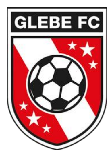
Glebe 1 Hythe Town 2