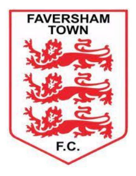
Hythe Town 2 Faversham Town 1