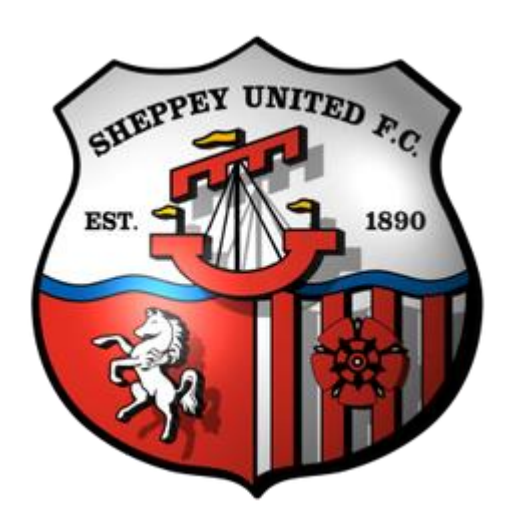
Hythe Town 1 Sheppey United 0