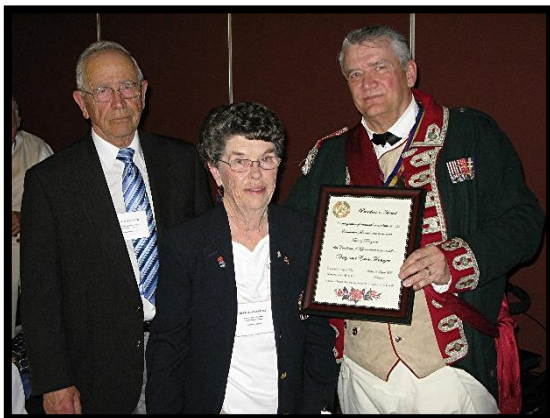
President's Award presented to:

We acknowledge the dedication and efforts of these individuals to the preserving of the history of the Edmonton Branch.