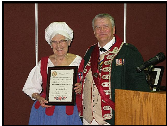
President's Award presented to: