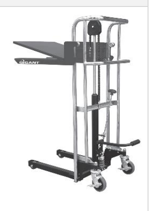
Table dimension: 650 x 576mm