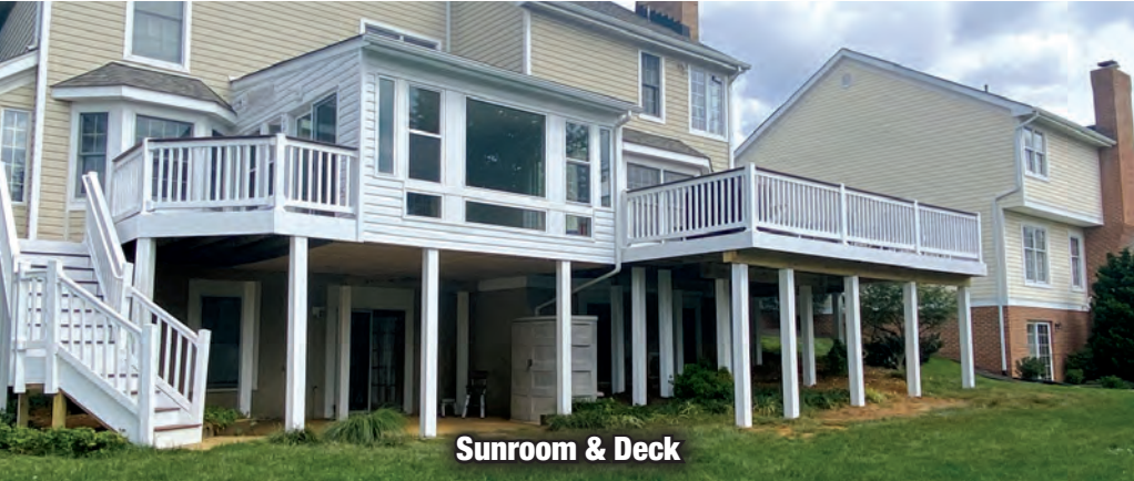
Sunroom & Deck