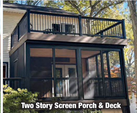
Two Story Screen Porch & Deck