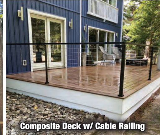
Composite Deck w/ Cable Railing

Spring Sale! 30% OFF DECK REFACING & NEW DECKS