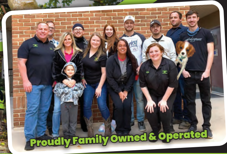
Proudly Family Owned & Operated

Must mention this ad at time of estimate. Cannot be combined with other offers or discounts. Expires 6/15/26.