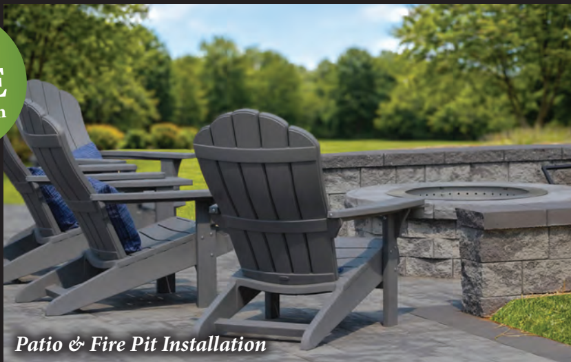
Patio & Fire Pit Installation