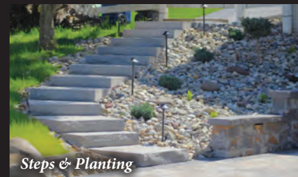
Steps & Planting