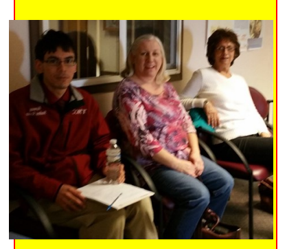
Meeting with Tribal Council Pictured: