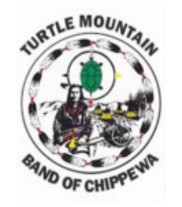
Turtle Mountain Band of