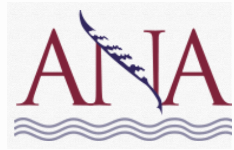
Administration for Native Americans