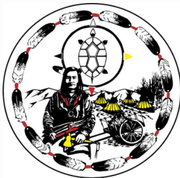
Turtle Mountain Band of Chippewa