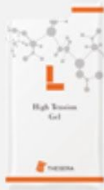
High Tension Gel