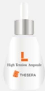
High Tension Ampoule [Brightening/Wrinkle improvement]

Peptide complex ingredients improves wrinkles. 9 natural extract and 4 natural oil nourish skin. Directions : Absorb 10 drops of ampoule on the whole face.