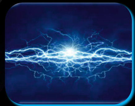
Increased Power Output