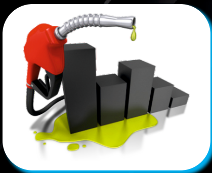
Increased Fuel Efficiency