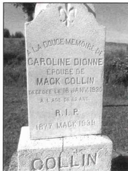
*This original tombstone has been replaced in St. Agatha Lower Cenetry