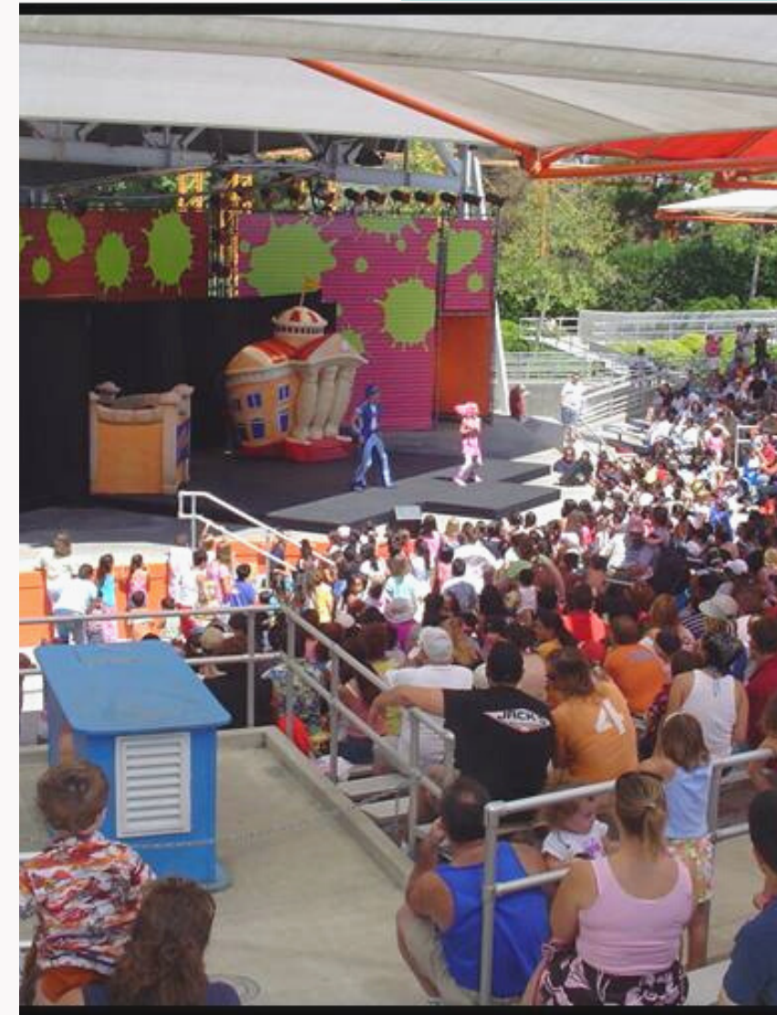
Lazy Town Live!