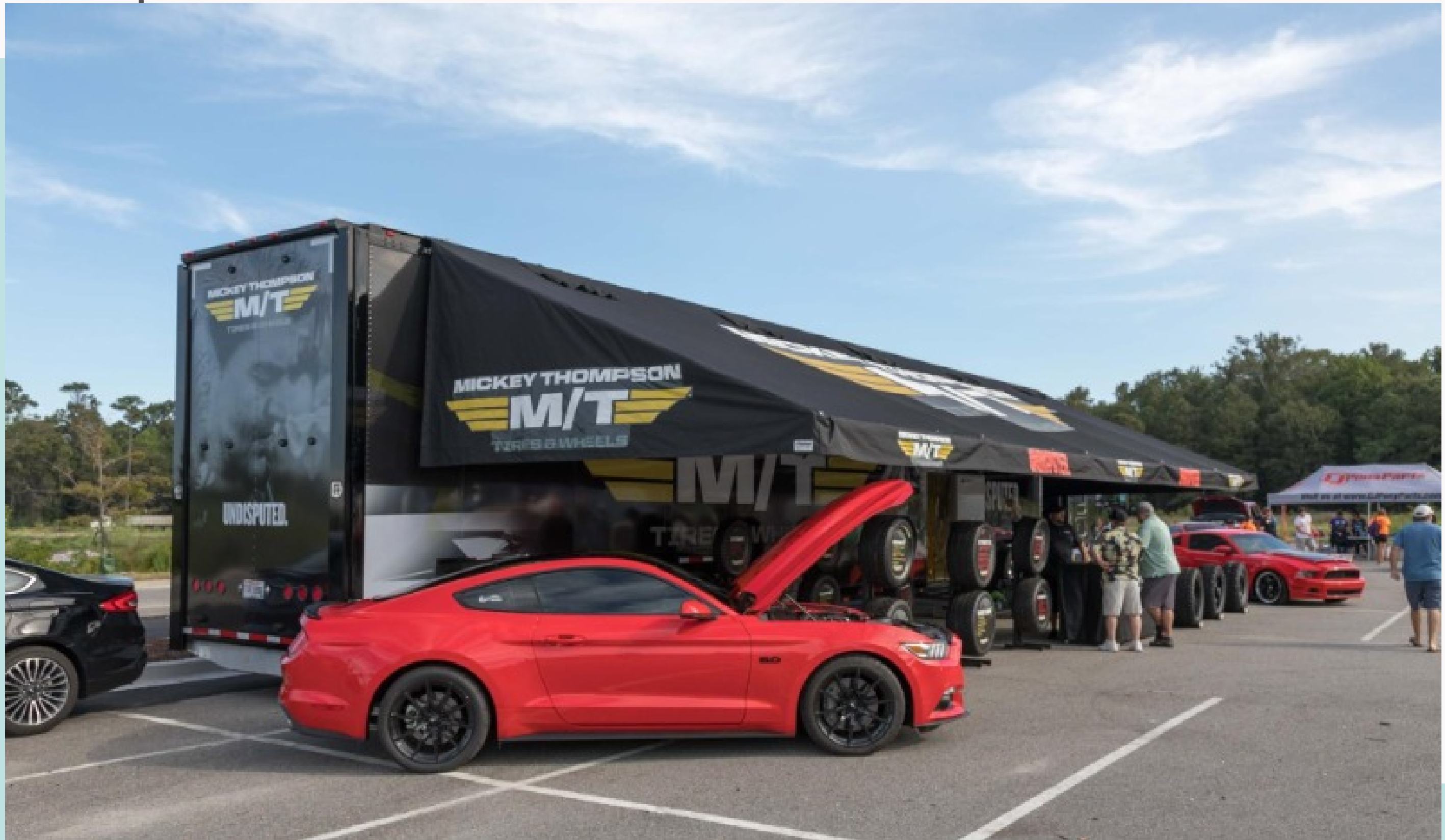
MICKEY THOMPSON TIRES AND RIMS TOUR