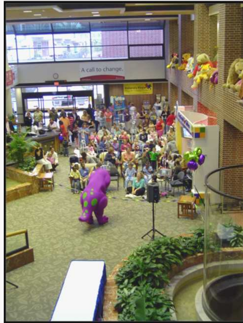
Children's Miracle Network Hospital Performance