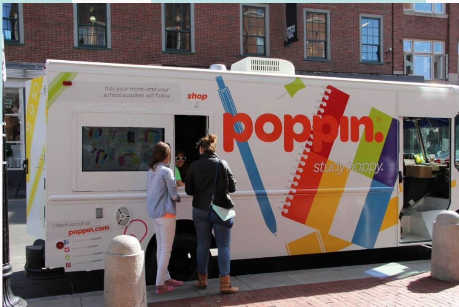
Poppin Back to School Tour