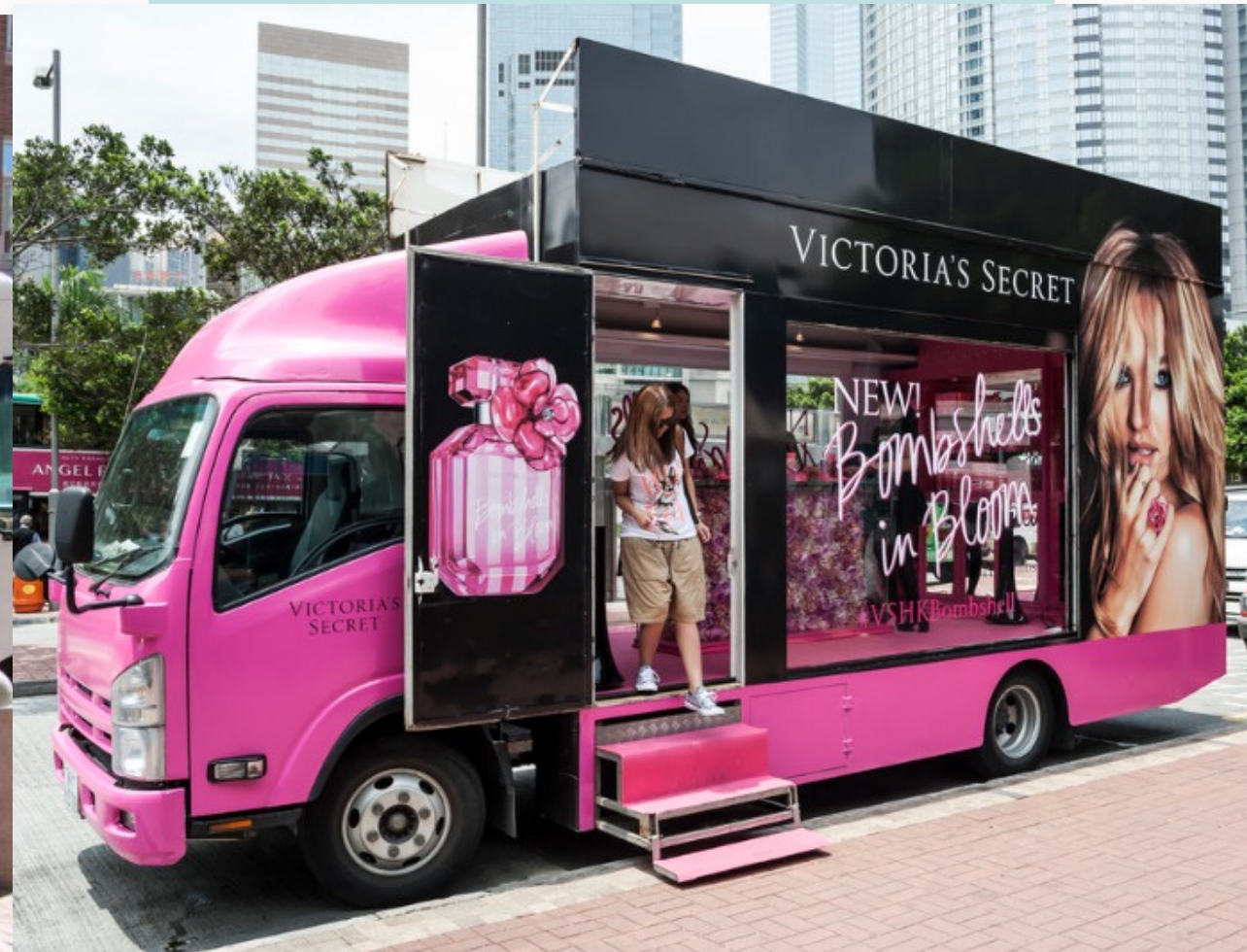
Victoria's Secret Tour