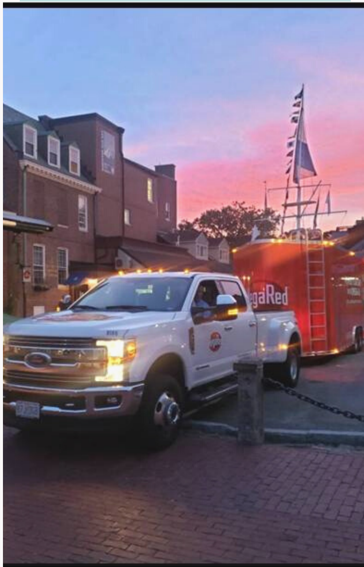
OmegaTown Powered by MegaRed