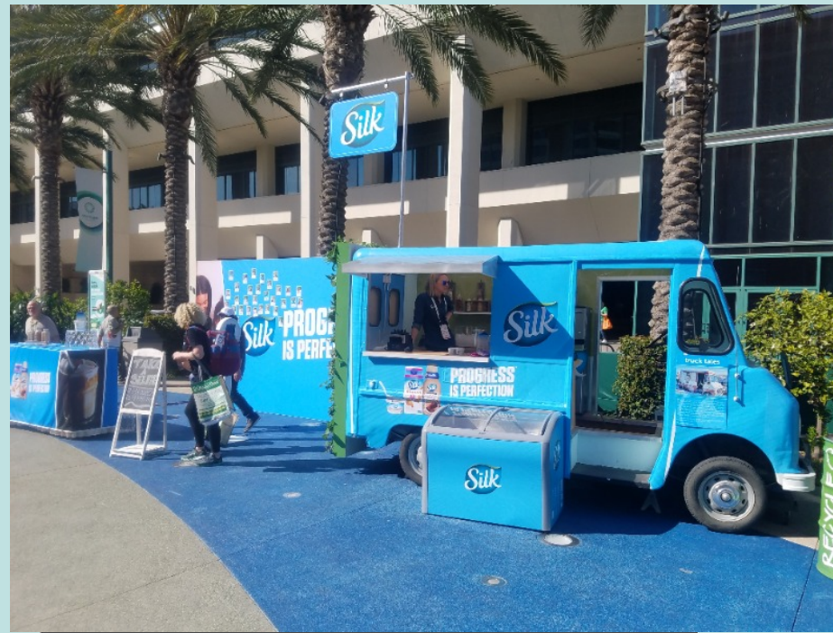
Silk Street Sampling Tour