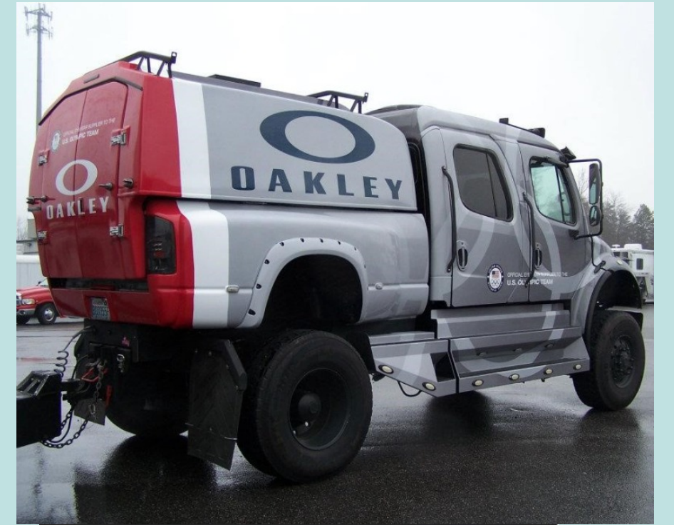
Oakley Summer Eyewear The Challenge Tour