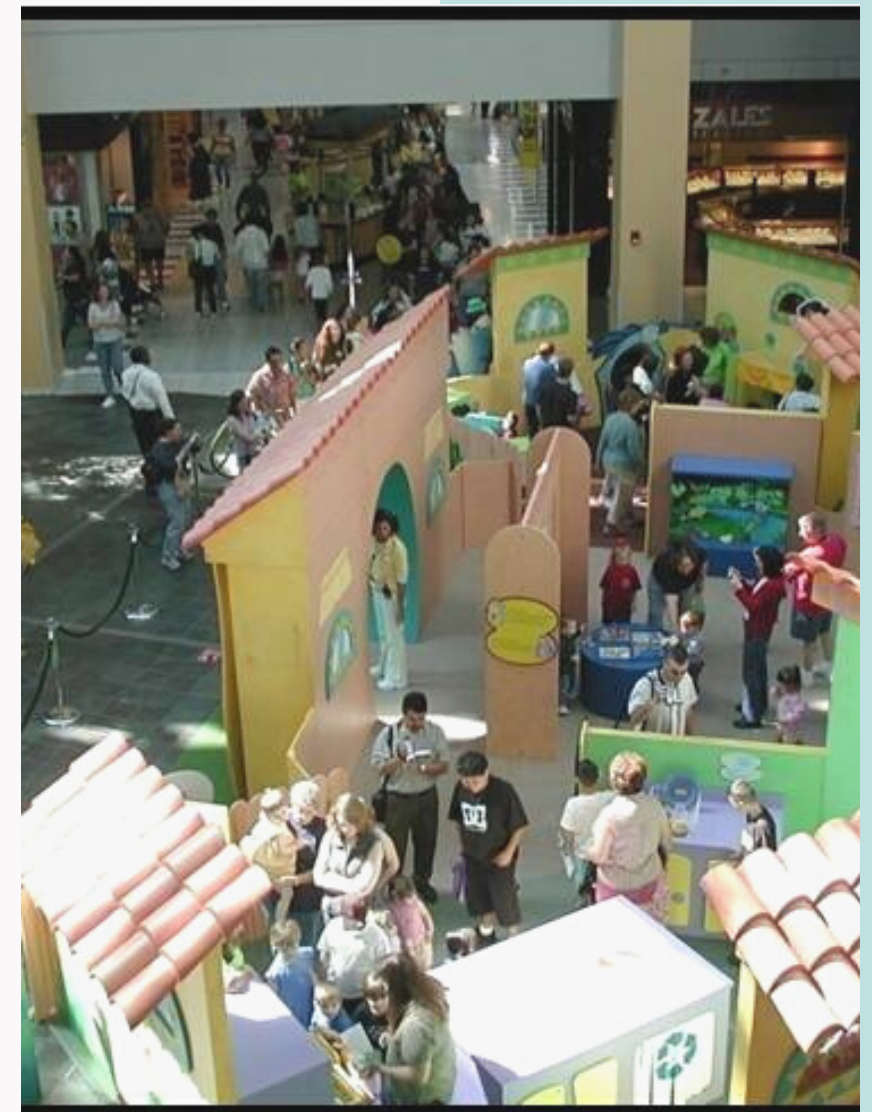
La Casa de Dora Mall Tour