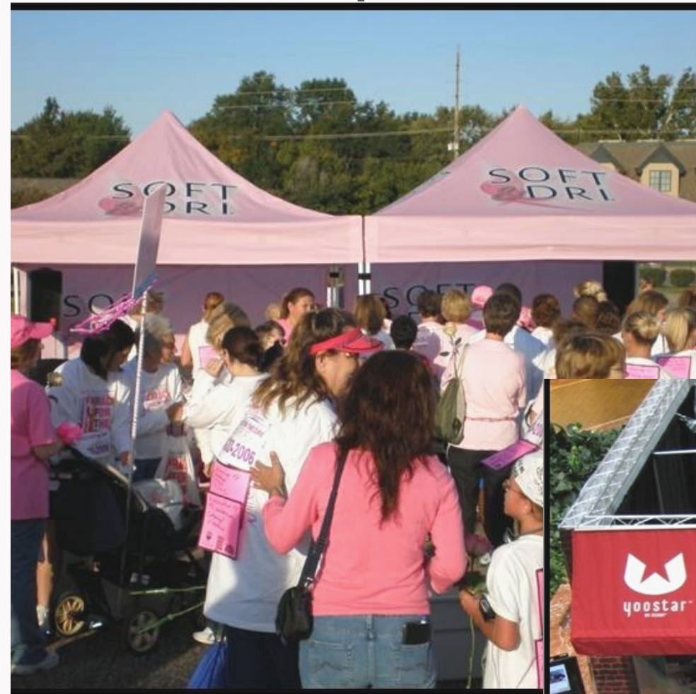
Soft & Dri

Honored to showcase a diverse background of experience.