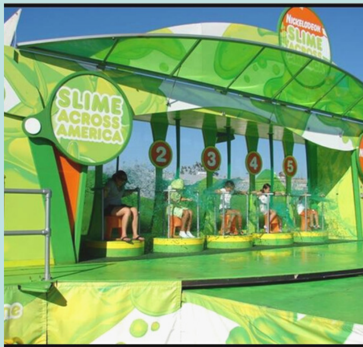
Nickelodeon's Slime Across America Tour