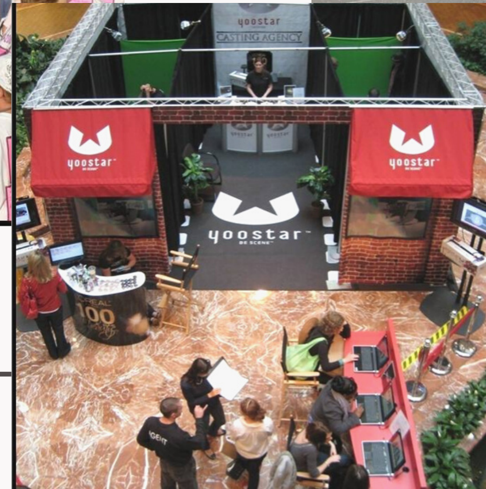
Yoostar Casting Agency