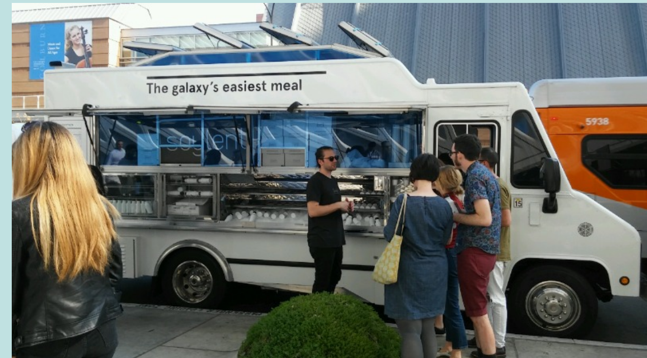
Soylent Sampling Food Truck Tour