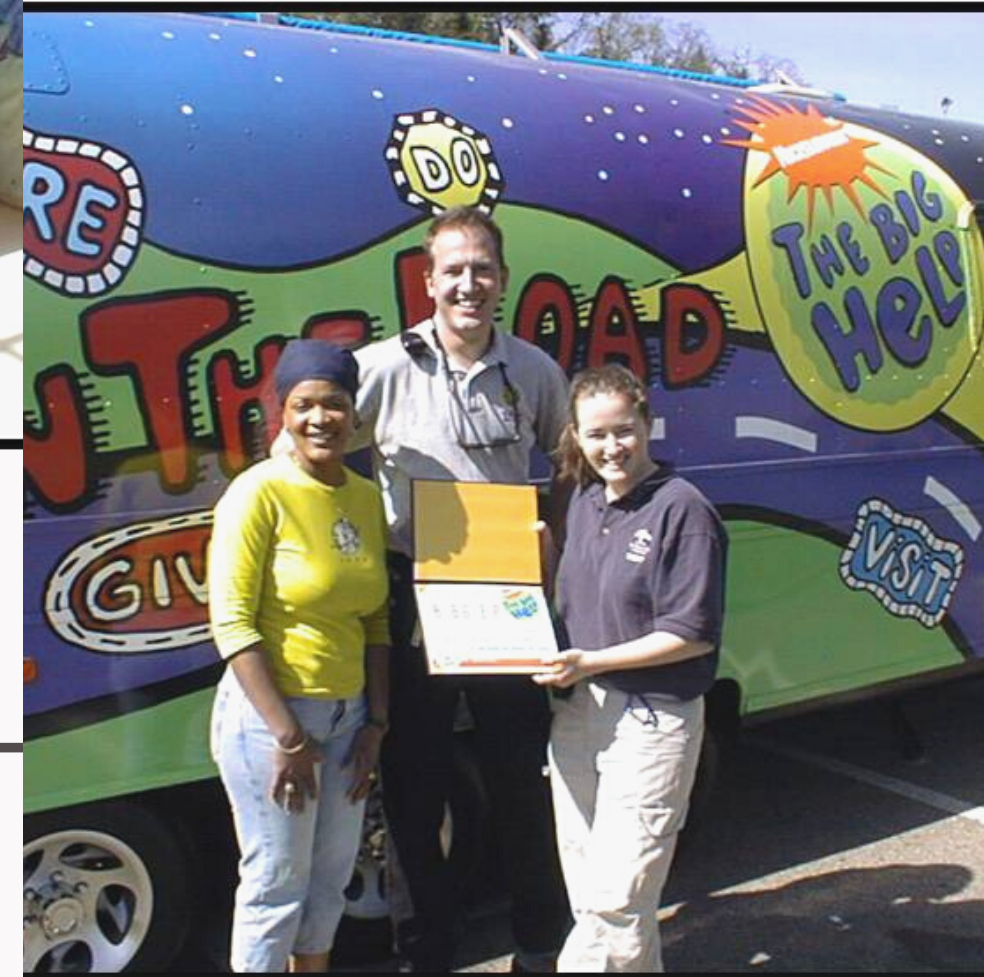
Big Help Day Proclamation