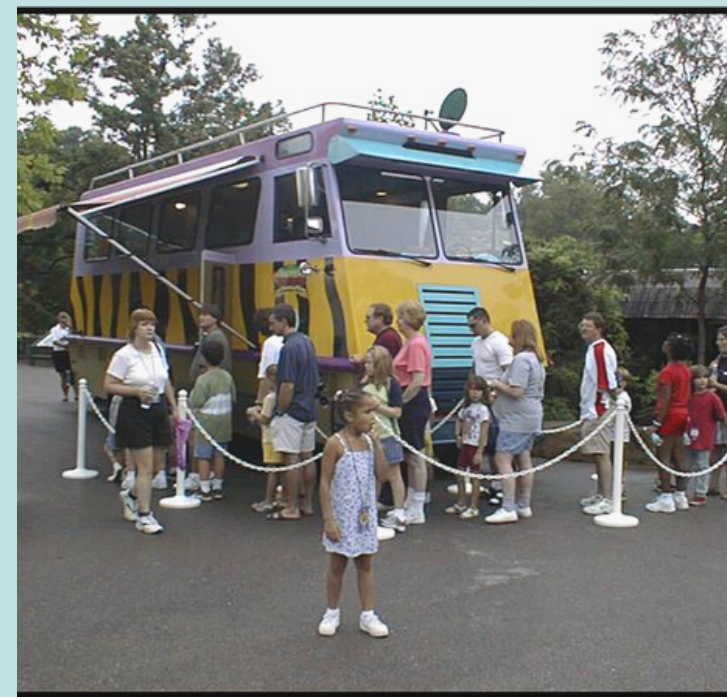
Wild Thornberry's Comvee Tour