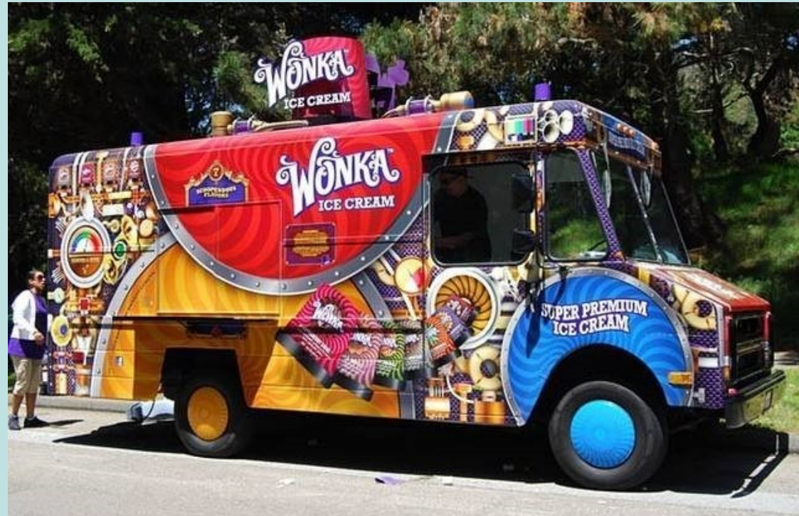
Wonka Street Teams Tour

We've tackled that and a little of everything in-between!