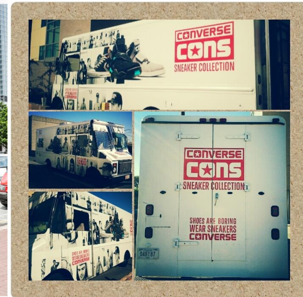
Converse Sneaker Collection Tour