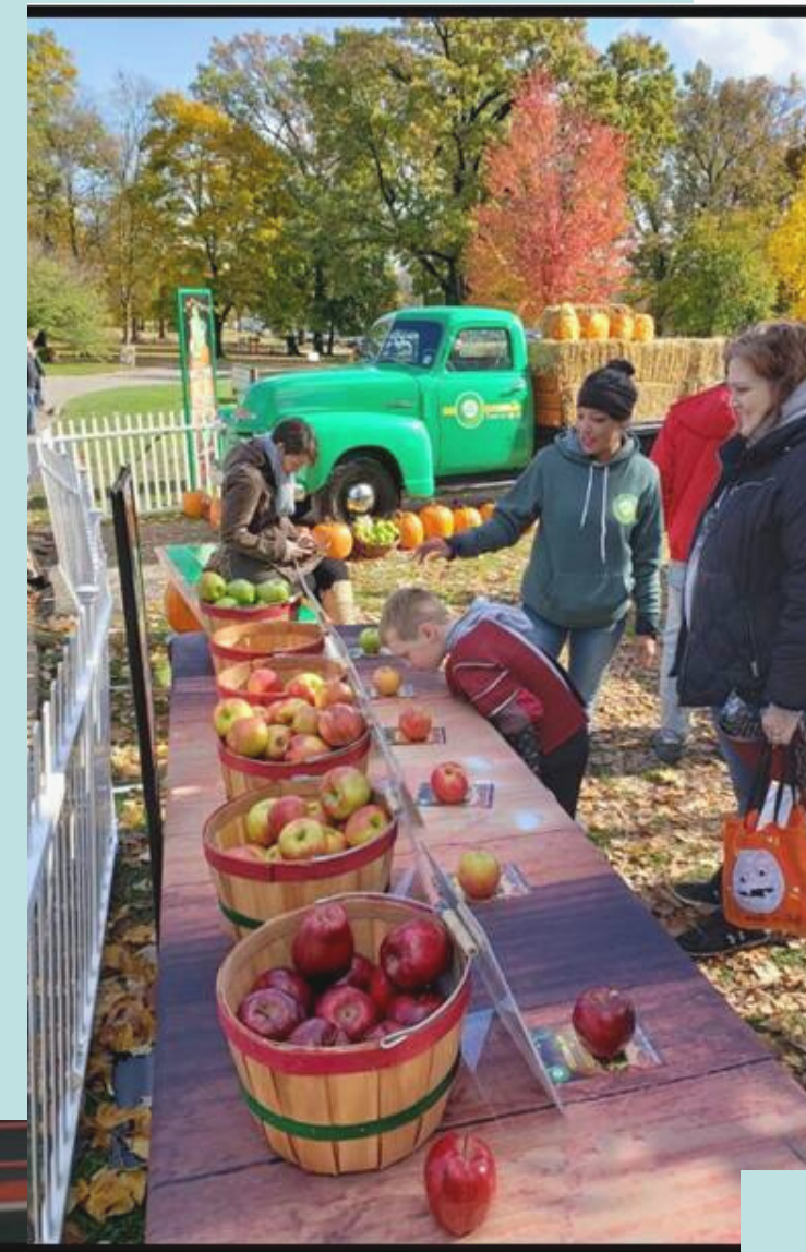
Air Wick's Fall Fest