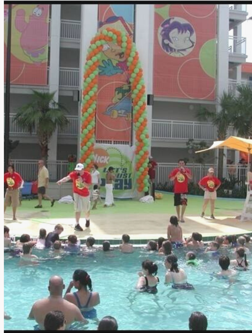
Nick Hotel Grand Opening