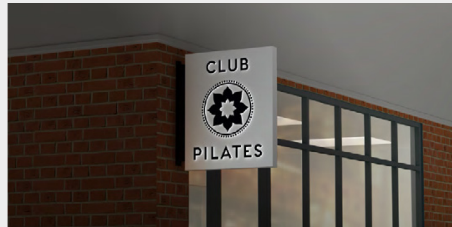
Internally illuminated blade signage.