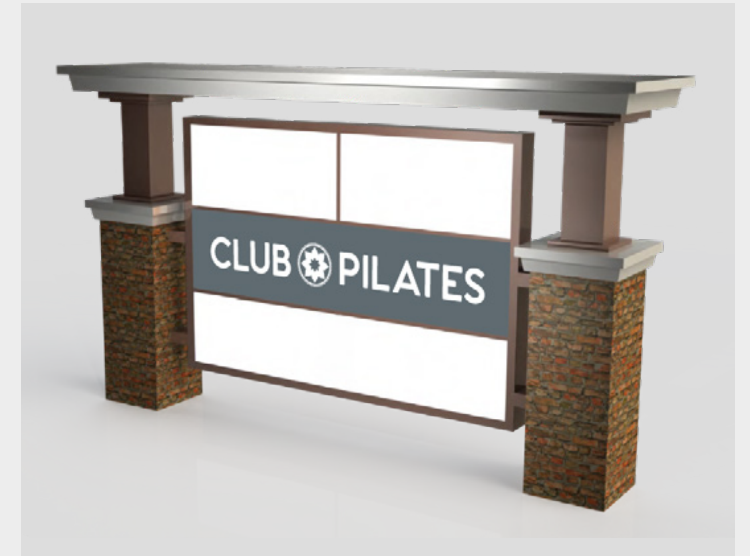
Mockup of a replacement face in tenant signage.