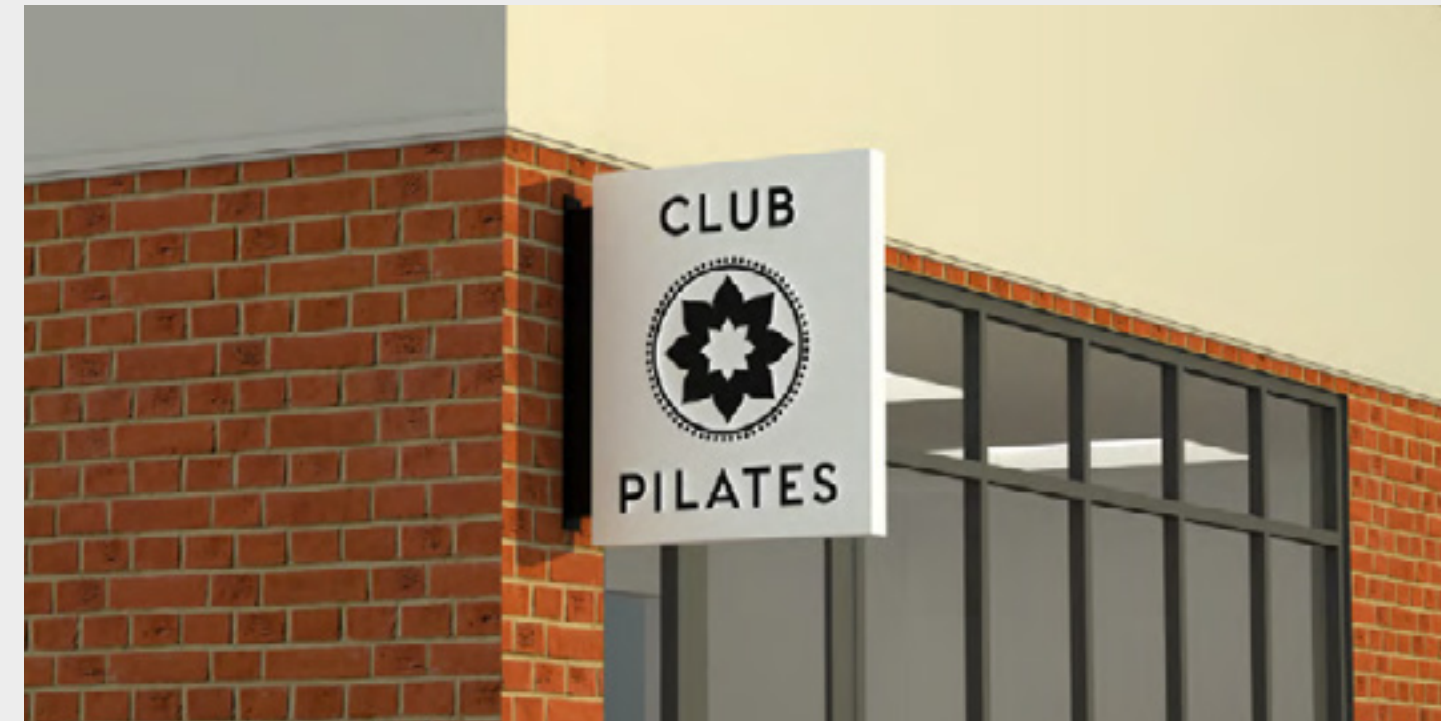
Non-illuminated blade signage.