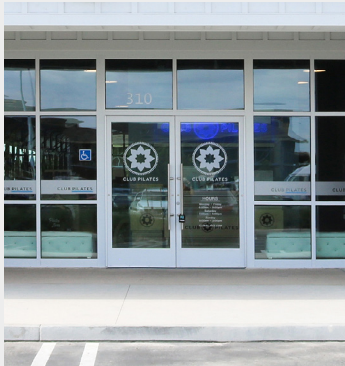
Example of exterior window and door graphics.