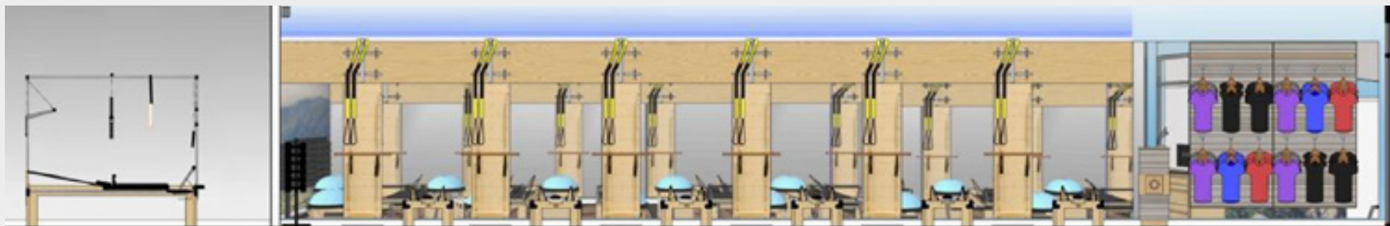
Side view of a standard site layout.