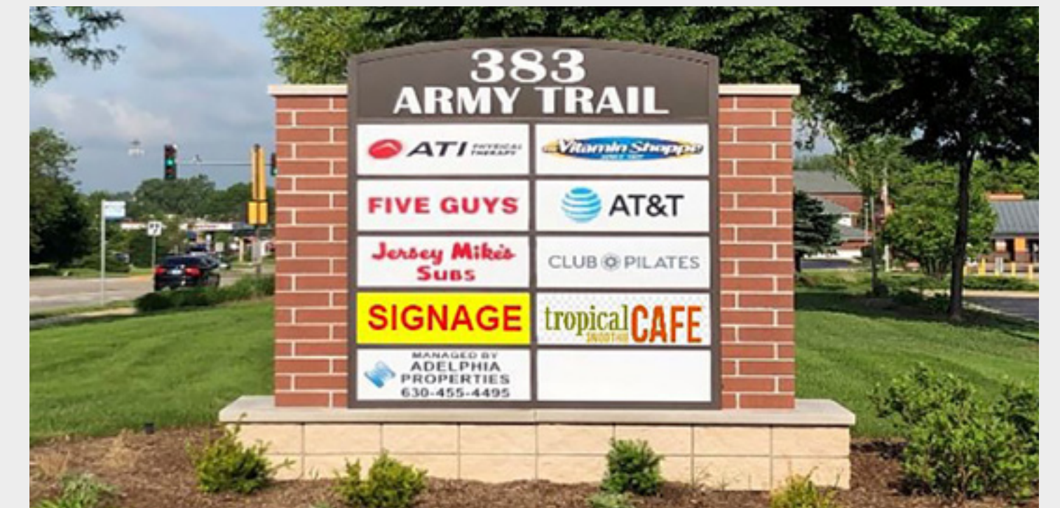
Example of a replacement face in a shopping center.