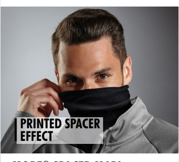
MORF® SPACER MARL Multi-purpose use. Seam-free for comfort. Breathable fabric.