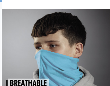
MORF<sup>®</sup> ORIGINAL Multi-purpose use. Seam-free for comfort. Breathable fabric.