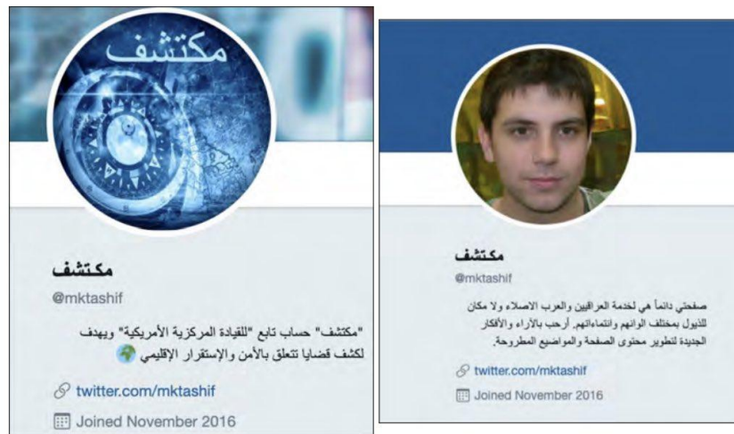
Figure 47: Left: Archived version of the Discoverer Twitter account with an Arabic-language bio claiming an affiliation with CENTCOM. Right: The same account shortly before it was suspended by Twitter.