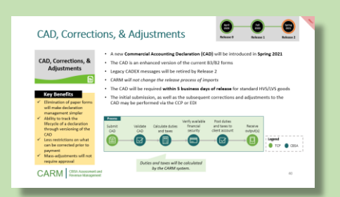
CARM 'Solution Spotlights'