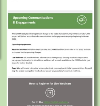
Webinar advertisement email templates