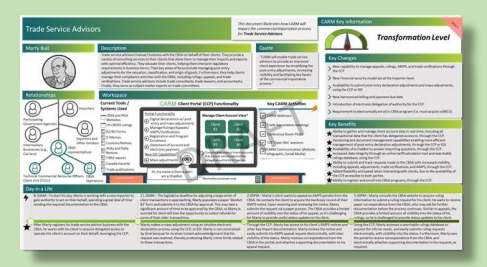
CARM TCP Personas

This package includes the following key CARM products: